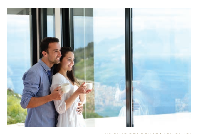
JULPHAR RESIDENCE | ABU DHABI