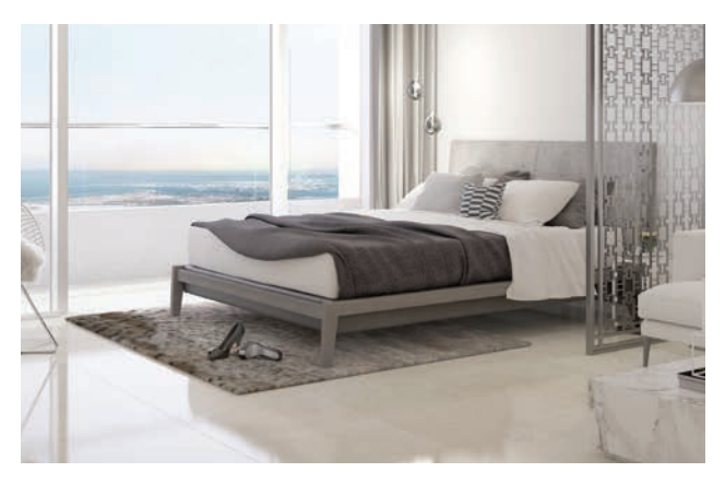
JULPHAR RESIDENCE | ABU DHABI