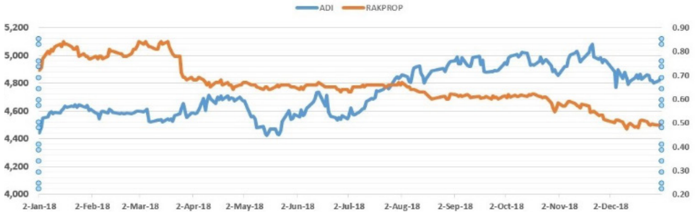
Company’s Share Price Compared to the Market Index

2. Comparing the Company’s index to the sector index