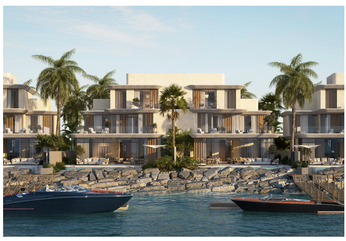
ANANTARA MINA RAS AL KHAIMAH RESIDENCES