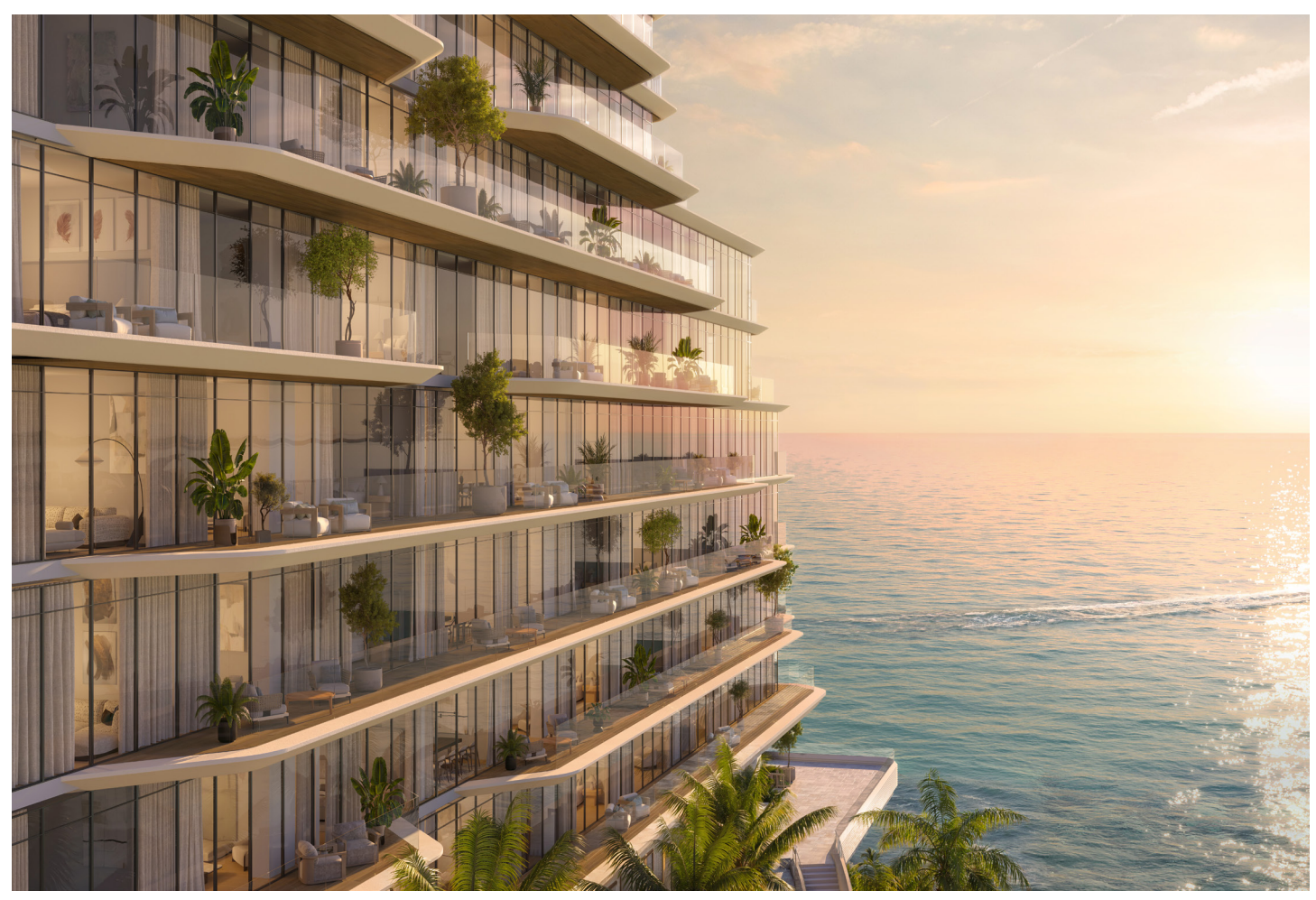
ANANTARA MINA RAS AL KHAIMAH RESIDENCES