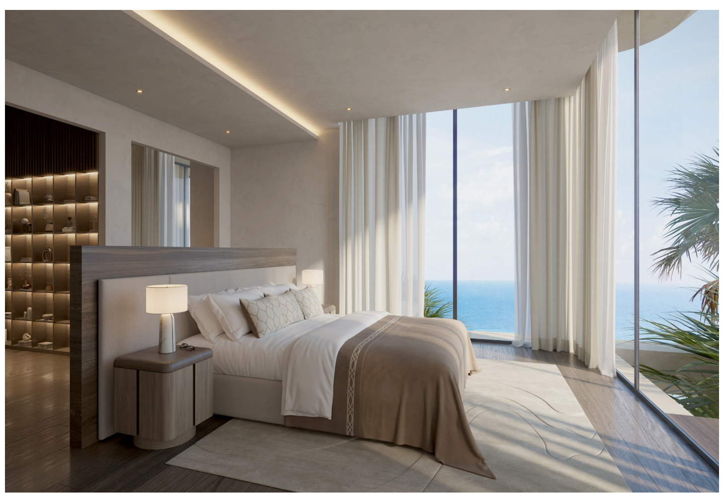
ANANTARA MINA RAS AL KHAIMAH RESIDENCES