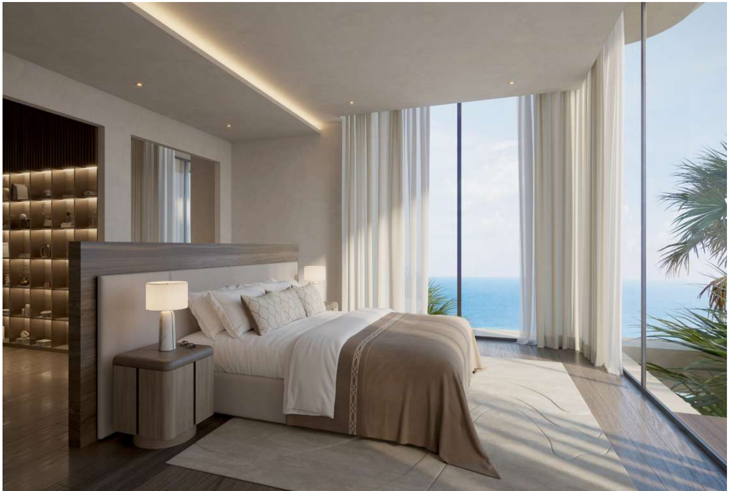
ANANTARA MINA RAS AL KHAIMAH RESIDENCES