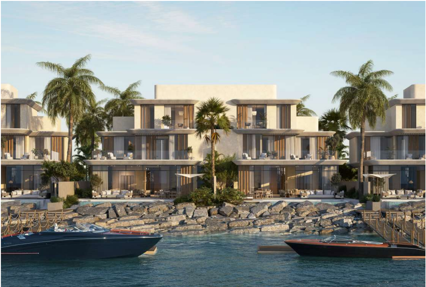
ANANTARA MINA RAS AL KHAIMAH RESIDENCES